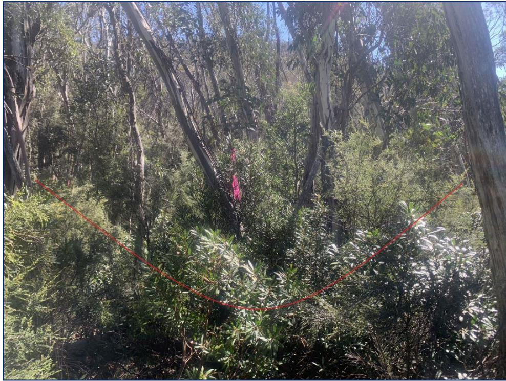
Figure 2 | Proposed trail alignment identifying the need for vegetation clearing