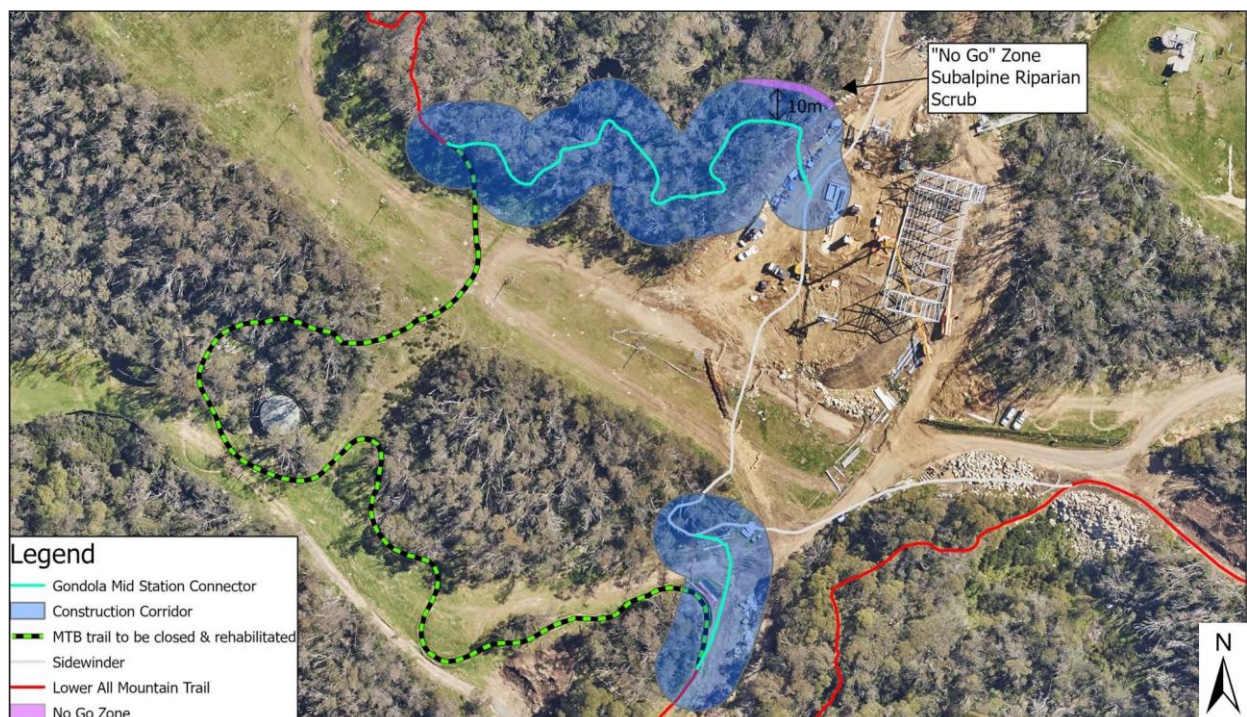
Figure 1 | Site map identifying the proposed Mid Station Connector trail in conjunction with the existing Lower All-Mountain trail

The Applicant seeks approval for the realignment of the Lower All-Mountain trail which would include the closure and rehabilitation of the existing Lower All-Mountain trail and the addition of a new gondola Mid Station Connector Mountain Bike trail. The new Mid Station Connector trail will provide a diversion for riders when the existing trail requires closure and is intended to provide a new and interesting riding experience for users ( Figure 1 ).